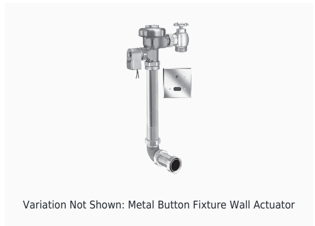
Variation Not Shown: Metal Button Fixture Wall Actuator